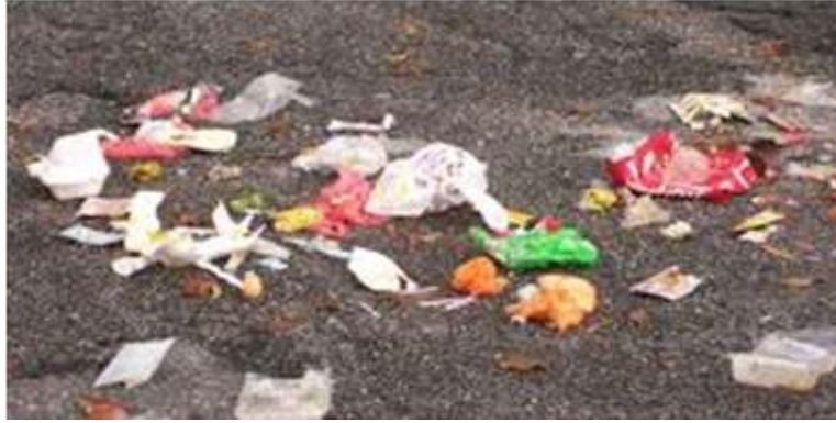
Picture 7 - Garbage all over the parking lot