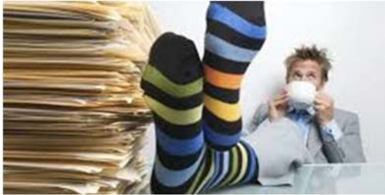
Picture 1 – lots of work to do but nobody is doing it